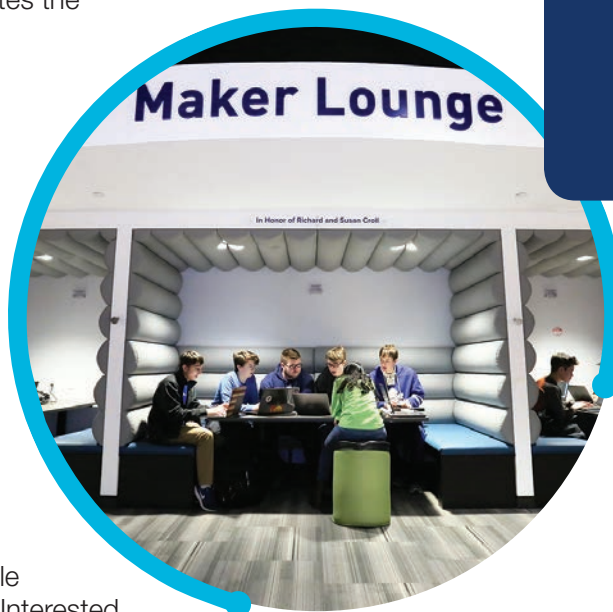
IN2, Steve and Jamie Chen Center for Innovation and Inquiry

IMSA TALENT is an enrichment inquiry learning program helping Illinois middle school and high school students build and launch STEM business ventures. Interested teens may take advantage of TALENT workshops, mentors, internships, summer camps, pitch competitions and IMSA's membership in 1871, Chicagoland's acclaimed incubator for digital startups.